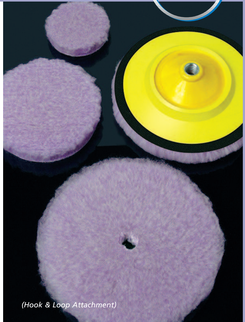
(Hook & Loop Attachment)